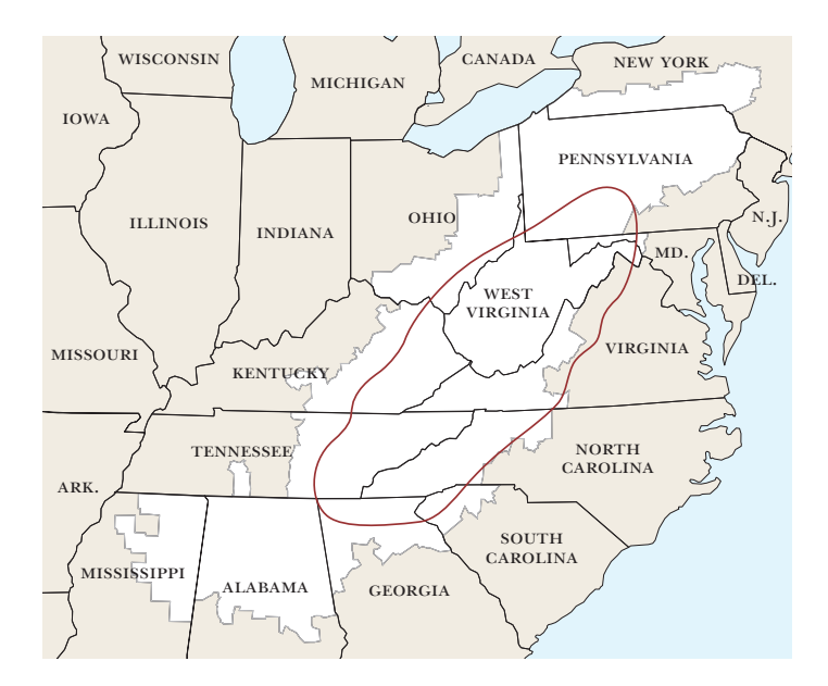
Figure 1: Appalachia as defined by the ARC (outer border) and the 'core' as defined by Ulack and Raitz (1981). Figure is adapted from Ulack and Raitz (1981) and also used in Reed (2018a).

are oriented around places. We never forget our native places, and we go back as often as possible. Our place is always close on our minds. It is one of the unifying values of mountain people, the attachment to one's place'. In fact, many Appalachian people have a clear idea of a particular place, the 'homeplace' described in Cox (2006). This is the reference point for many Appalachians, and the homeplace is usually the local community or a particular place in the local community.